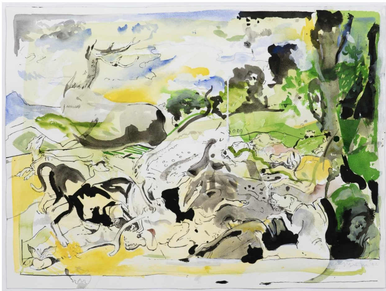
Cecily Brown, The Hunt , 2022.