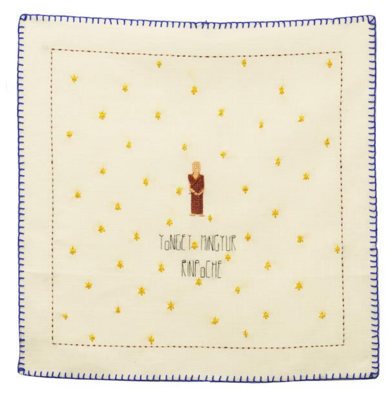
Elsa Hansen - Yongey Mingyur Rinpoche, 2023. Silk, velvet and gold hand embroidery on linen; 13 x 13 inches