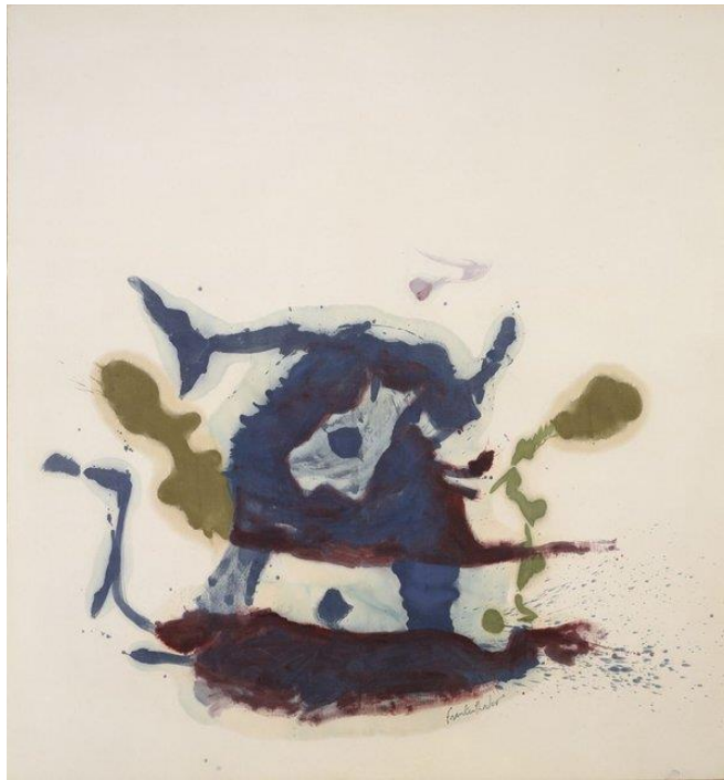
Helen Frankenthaler Vessel 1961, oil paint on canvas, 2540 x 2390 mm, Collection Helen Frankenthaler Foundation, New York.

This room brings together works by a leading abstract painter of the post-war period