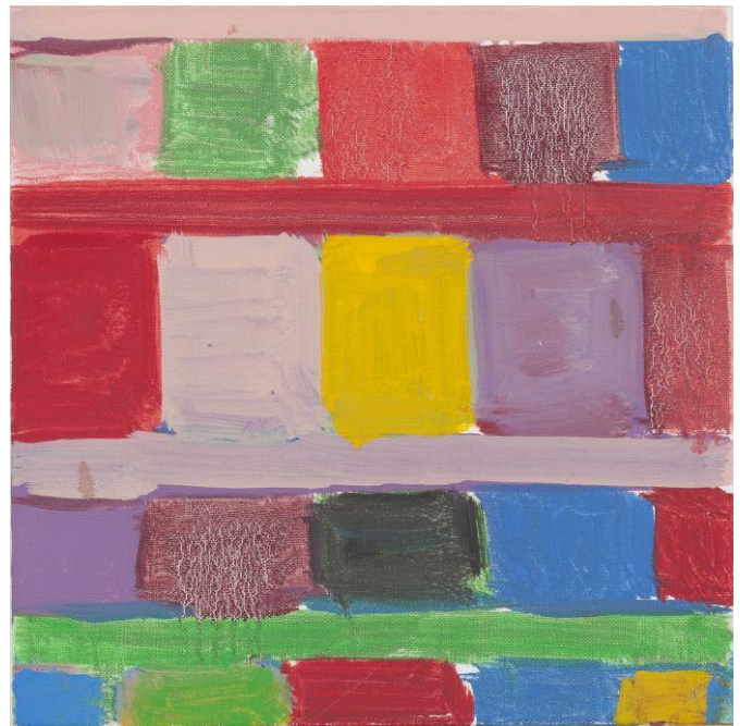
Untitled, 2013

It's as if, for each painting, Whitney had climbed a ladder and then kicked it away. A viewer on the ground can only wonder how he got up there. A picture's dynamics may seem about to resolve in one way: heraldically flat, for