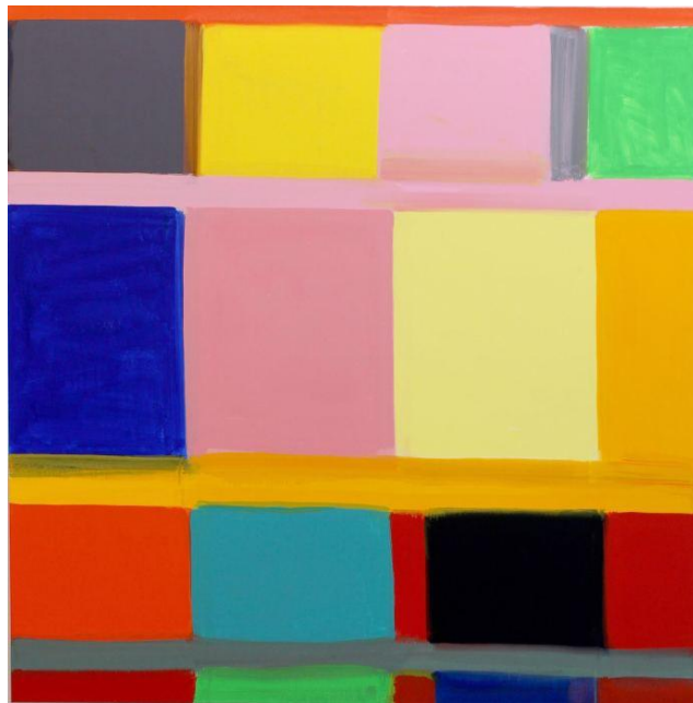
My Tina Turner, 2013