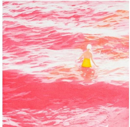
Isca Greenfield-Sanders WADING II (PINK) , 2012, 2012 Paulson Bott Press $2,500

Isca Greenfield-Sanders's prints and paintings are intended to mimic the fuzzy and often distorted logic of nostalgia. Her works encapsulate the effect of recalling a memory over and over; with time, we gradually forget details, only remembering the strongest colors, lights, shapes, and feelings. This act of repetition and the subtle variation that ensues, makes the artist's practice perfectly aligned with printmaking.