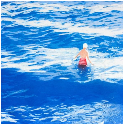
Isca Greenfield-Sanders WADING II (BLUE) , 2012 Paulson Bott Press $2,500