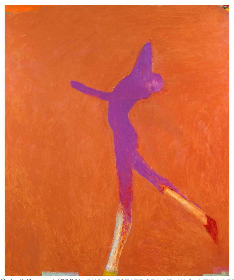
Nathan Oliveira's 'Cobalt Dancer' (2001).