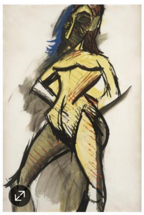
Pablo Picasso's 'Yellow Nude' (1907). PHOTO: PABLO PICASSO/LICENSED BY ARTIST RIGHTS SOCIETY (ARS), NEW YORK

The Berggruen Gallery will open Jan. 13 with an exhibition called "The Human Form," featuring works starting in the early 20th century. Henri Matisse, Lucian Freud and contemporary artists such as George Condo will be represented. The 50 works range from Pablo Picasso's 1907 "Yellow Nude," an angular, figurative watercolor, to James Crosby's 2016 "Deconstructed Hoodie," a conceptual piece consisting of a hood covered in cement. The show will end on March 4.